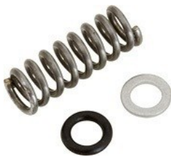
CP # 20781

Idle Air mixture screw repacking Kit. Kit includes Spring, Washer and O-Ring.