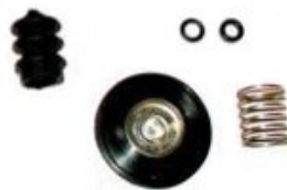
CP # 20721

Idle Air mixture screw repacking Kit. Kit includes Spring, Washer and O-Ring.