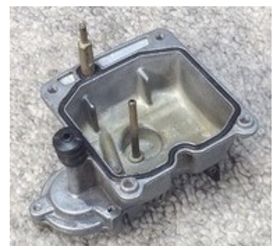
CP # 16708

Float Bow Assembly Replaces OEM# 27159-92